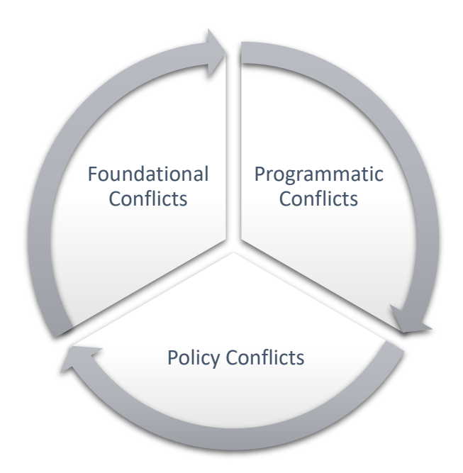
Figure 1 Levels and Types of Change and Conflict

Third, the manner in which actors respond to the type and level of social and political change shapes their overall position and strategies towards a national political order. Groups that organise around policies and programmes are more likely to adopt reformist stance and choose methods of claim-making that are prescribed by the state. In contrast, groups that reject the basic foundation of a nation-state might have greater propensity to engage in subversive and anti-systemic strategies.